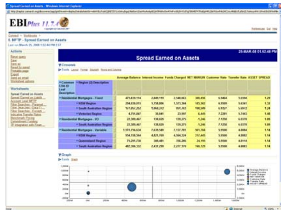
Create and Manage Analyst Reporting Online