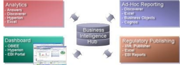
EBIPlus Business Intelligence Hub

When delivered with EBIPlus you get the added benefit of the Foundation Services to link your Enterprise Decision Support Environment to sophisticated value-adding analytic processing.